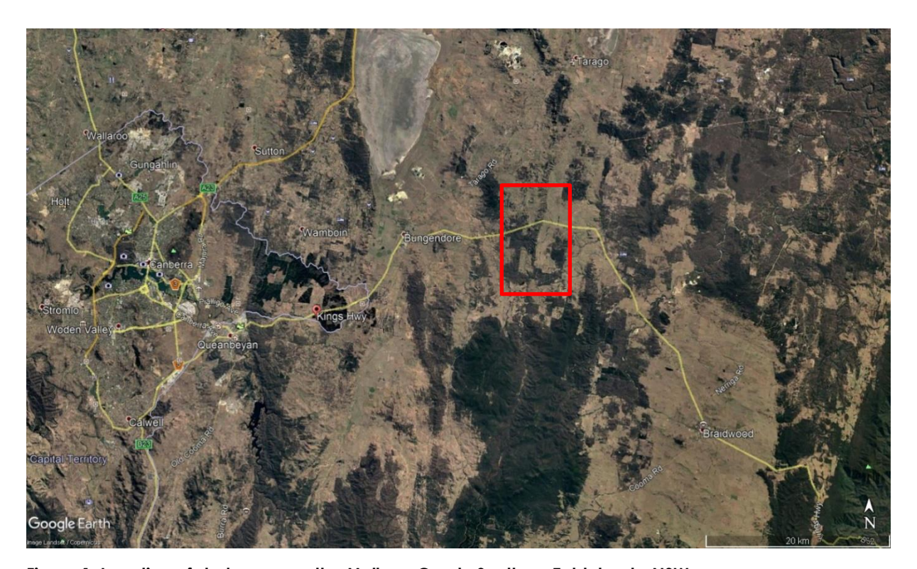
Figure 1. Location of study area on the Mulloon Creek, Southern Tablelands, NSW

The 19 transects are located between the MCNF Home Farm property in the southern/upstream parts of the Mulloon catchment. The Sandhills Creek catchment confluence in the northern/downstream parts of the catchment with Mulloon Creek and becomes Reedy Creek (Figure 2; note: Transect 28 is actually located on Reedy Creek, about 600m directly east of the confluence, and Mulloon Creek becomes/is named Sandhills Creek after this confluence). This study area represents a total distance of almost 20km of stream length between the upstream and downstream sites.